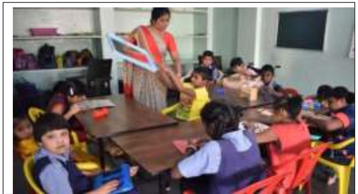
SPECIAL SCHOOL & VOCATIONAL TRAINING CENTRE