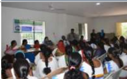
Training & Research