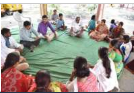
Community Based Rehabilitation

MANASA INSTITUTE OF CHILD HEALTH & DISABILITY STUDIES