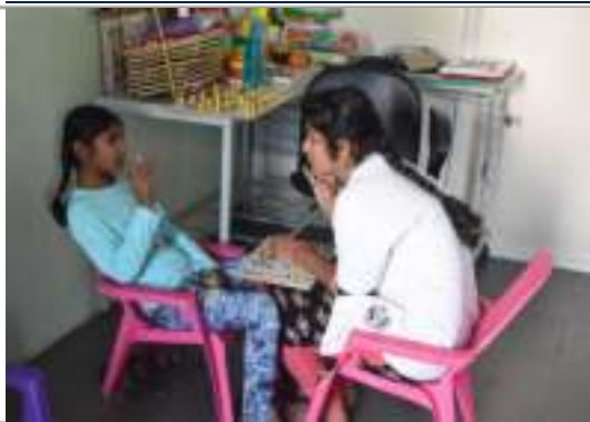
Clinical Health & Rehab therapy Services